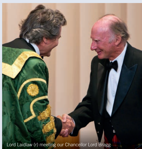
Lord Laidlaw (r) meeting our Chancellor Lord Bragg