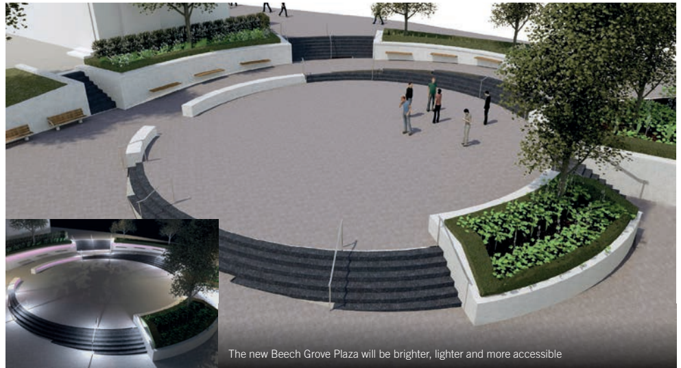
The new Beech Grove Plaza will be brighter, lighter and more accessible

"The project is split into phases and timed to ensure that University activities are maintained while minimising any potential disruption.