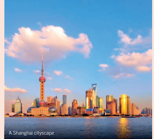
A Shanghai cityscape