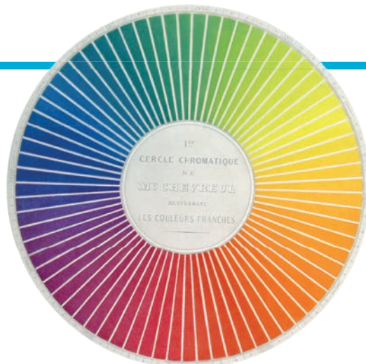
Cercles chromatiques de ME Chevreul (Paris: E Thunot, 1855).

Admission is free, but places are limited. To register your attendance, email enterpriseofculture@leeds.ac.uk . A wine