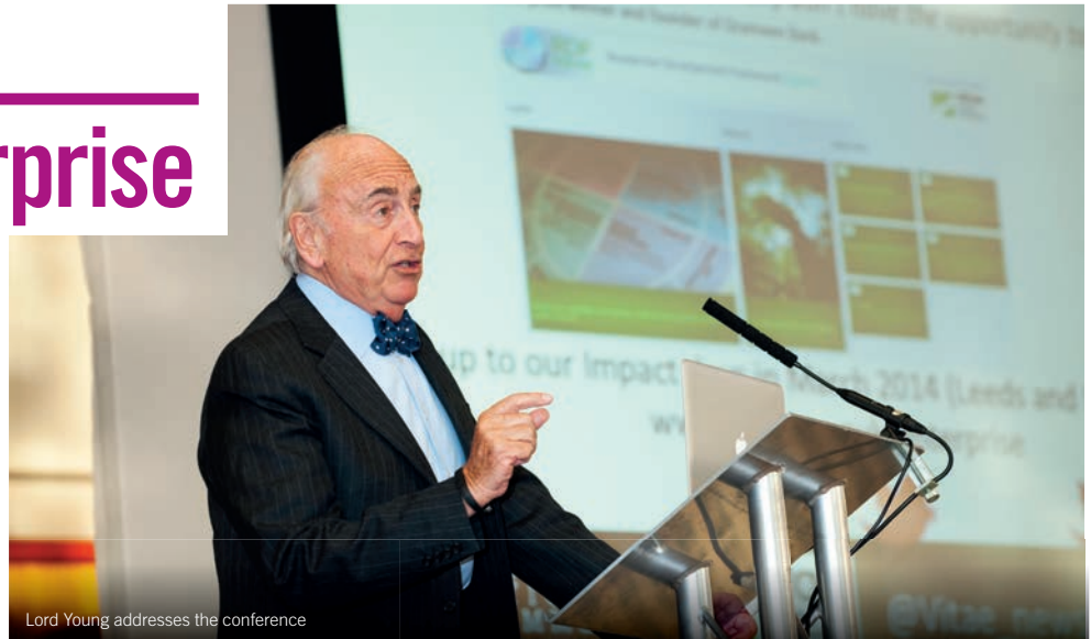
Lord Young addresses the conference

Lord Young was introduced to Leeds' academics, students and alumni involved in enterprise. In his closing remarks at the afternoon Challenge Workshop, he said: "We are rapidly becoming a nation of small businesses. Over 95% of all businesses employ fewer than 10 people and