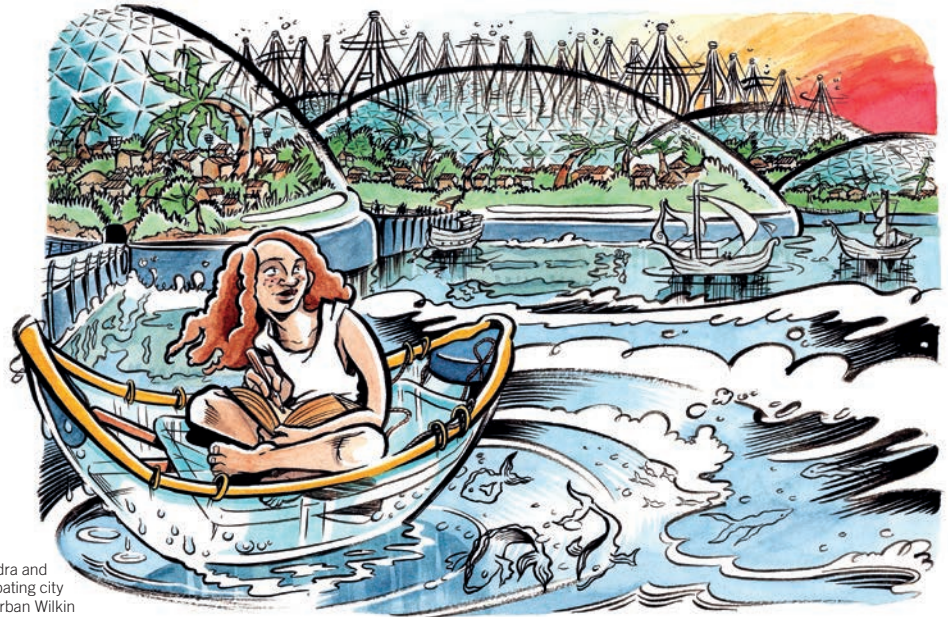
Phaedra and the floating city by Corban Wilkin

"The aim of the project was to work with young people in schools and other groups and to think about how current environmental issues and the challenges they pose might affect the