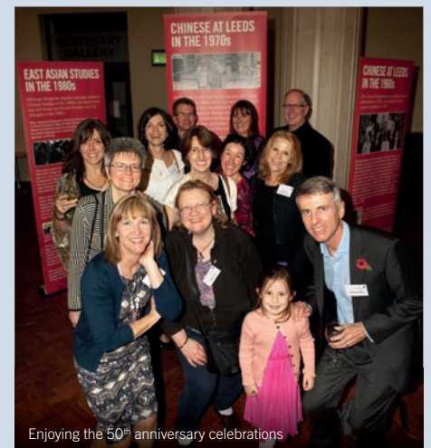
Enjoying the 50 th anniversary celebrations