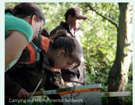
Carrying out environmental fieldwork