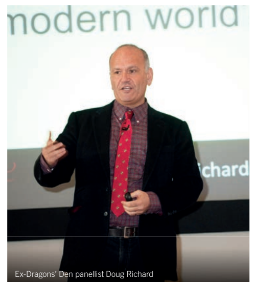
Ex-Dragons' Den panellist Doug Richard