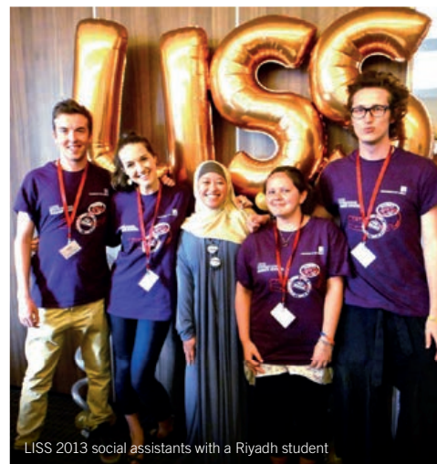
LISS 2013 social assistants with a Riyadh student