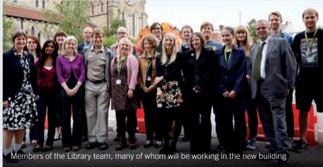
Members of the Library team, many of whom will be working in the new building