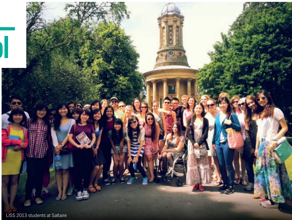
LISS 2013 students at Saltaire

Fridays are reserved for field trips that complement the modules: this year students visited Castle Howard, went down a coal mine at the National Coal Mining Museum, saw sporting venues at the Velodrome and Old Trafford in Manchester, visited the Brontë museum, and even the Drax Power Station for a module on renewable energy. Social trips are also organised – a seaside trip to Whitby, a visit to York, and a weekend in London, including a sword-fighting demo at the Globe Theatre and a tour of the Wimbledon Lawn Tennis Museum, were among those on offer this year. Leeds students who act as social assistants make sure that everyone settles in quickly and no-one is ever bored.