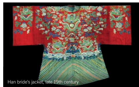
Han bride's jacket, late 19th century

The Qing Collection comprises over 200 nineteenth and early-twentieth century Chinese embroideries and tapestries, mostly acquired by Professor Barker of the Department of Textile Industries and his son during their work in China in the 1930s. The Qing Dynasty extends from 1644 to 1911, and was the last imperial dynasty. An extensive range of decorative motifs were used to decorate textiles, often destined for garments. This exhibition highlights the costumes in the collection, including several examples of dragon robes and female jackets, skirts and