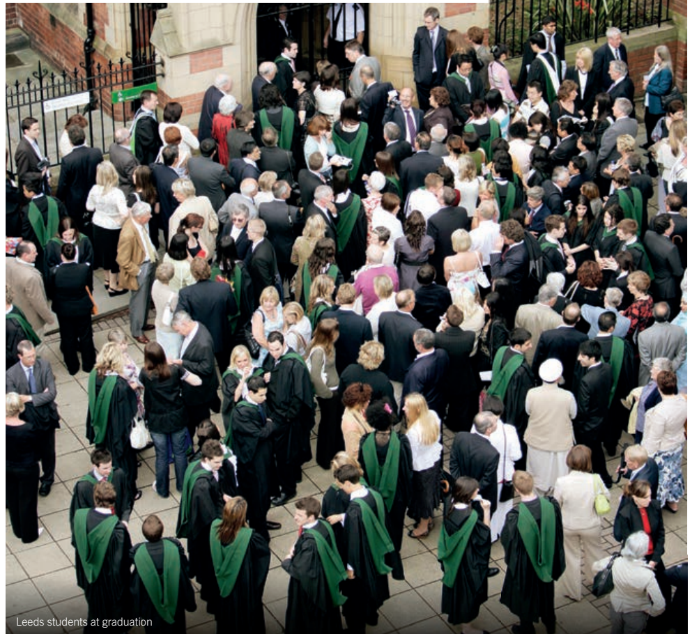
Leeds students at graduation

Graduation day marks not only the end of a successful course of study but also signals the transition from student to alumnus.